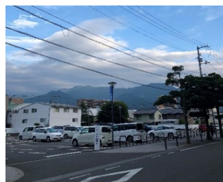
The view of the mountains from Saijo City Hall