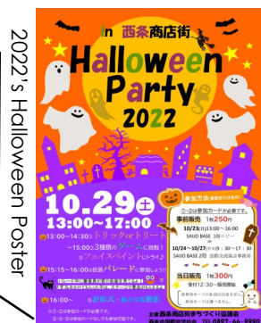
2022's Halloween Poster

On Oct. 29 (Sat.), the Saijo Shopping Street Community Council and the local volunteer organization ELIS co-hosted a Halloween Party in the Konyamachi Shopping Street for the first time in 3 years. The weather was great and about 2,000 people gathered there. Kids wore their best costumes and went door-to-door, trick-or-treating and playing games as they went.