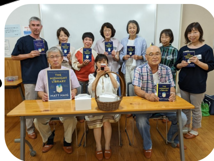
Commemorative photo at the last session