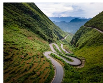
A view of the mountains in Hà Giang

When I first came to Saijo, the mountains stunned me with their incredible beauty. If you want to see mountains in Vietnam, you basically have to go the northern city of Hà Giang, which faces China. It's said that roads leading to the city are a bit difficult to navigate, so solo trips are generally not recommended. That's why I truly appreciate my new life in Saijo — when I bike to work, I get an up-close look at the majesty of the mountains.