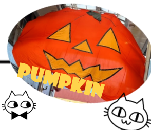
This year's float featured Huggy Wuggy!