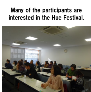
Many of the participants are interested in the Hue Festival.